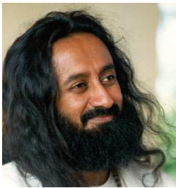
Officer introduction (look alike pictures on left) and backgrounds were given to our RUG.