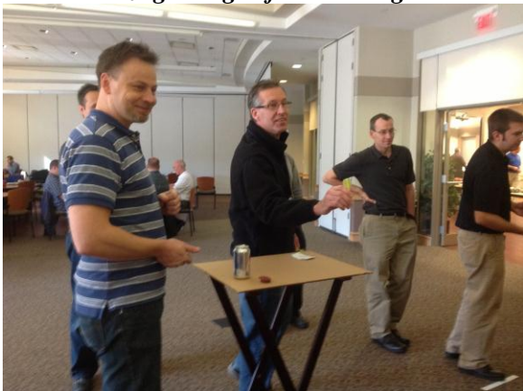
Prize gaming before meeting!

84 golfers played in the first scramble Golf Outing. Next outing will be July 17, 2014