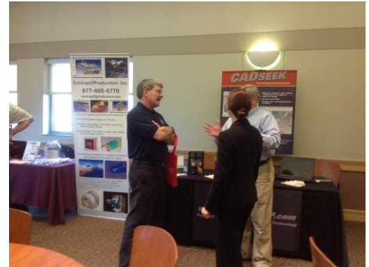
Vendors make our meeting possible, please support them!