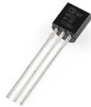
Interior temperature sensor