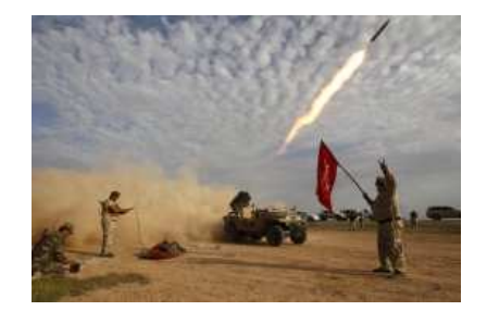
Our top news photography of the week. Slideshow